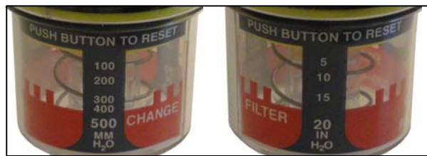
Filter Gauge shows both mm & inches ratings

Note: The monitor gauge has a 1/8" connection. It is mounted either on the weatherhood or on the outlet pipe depending on the filter assembly.