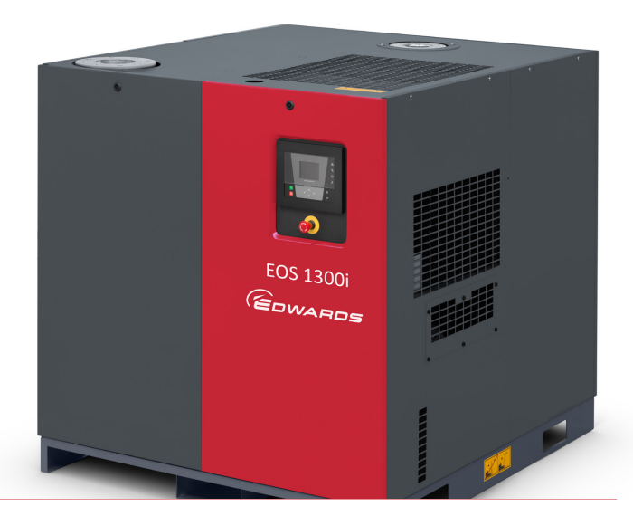
EOSi ROTARY SCREW PUMP

Ultra-high oil retention at all operating pressures Reduced environmental impact